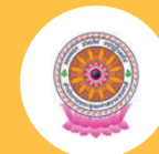
National Office of Buddhism