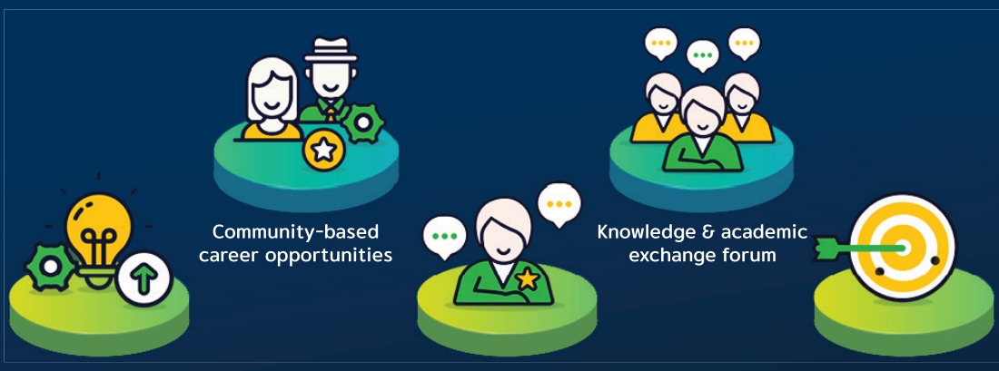
Community innovation development