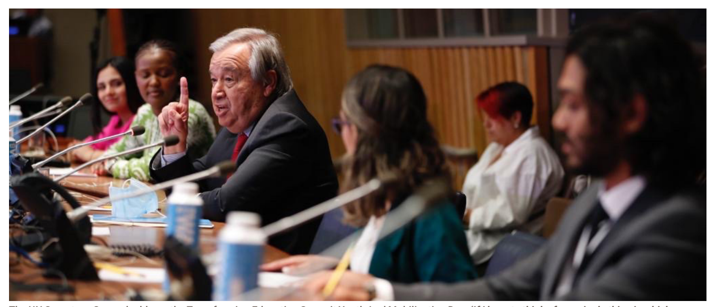
The UN Secretary-General address the Transforming Education Summit Youth-Led Mobilization Day: 'If I have to think of one single thing in which we should invest in, I would say education.' (Paulo Filguerias)