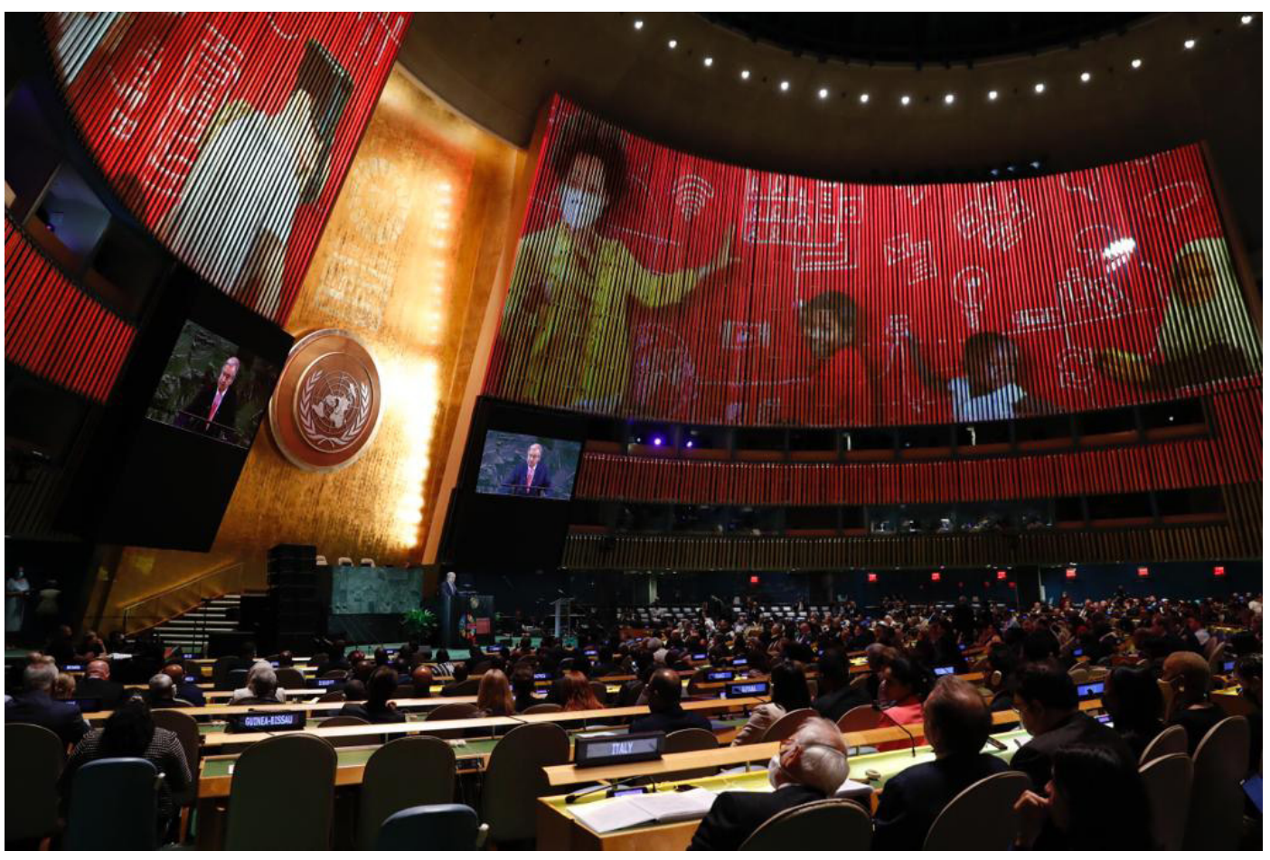
\textbf{UN Secretary-General addressing the Transforming Education Summit on Leaders Day.}

depends on all of us: on leadership, on enhancing existing systems, programmes, and governance; on greater financing; on civil participation and on our joint efforts.