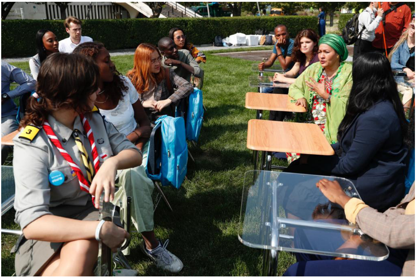
UN Deputy Secretary-General in conversation with young people at the UNICEF exhibition on the Global Learning Crisis.

education to the top of the global political agenda and to mobilize action, ambition, solidarity, and solutions to recover pandemic-related learning losses and sow the seeds to transform education for the breakthrough that our world so urgently needs.